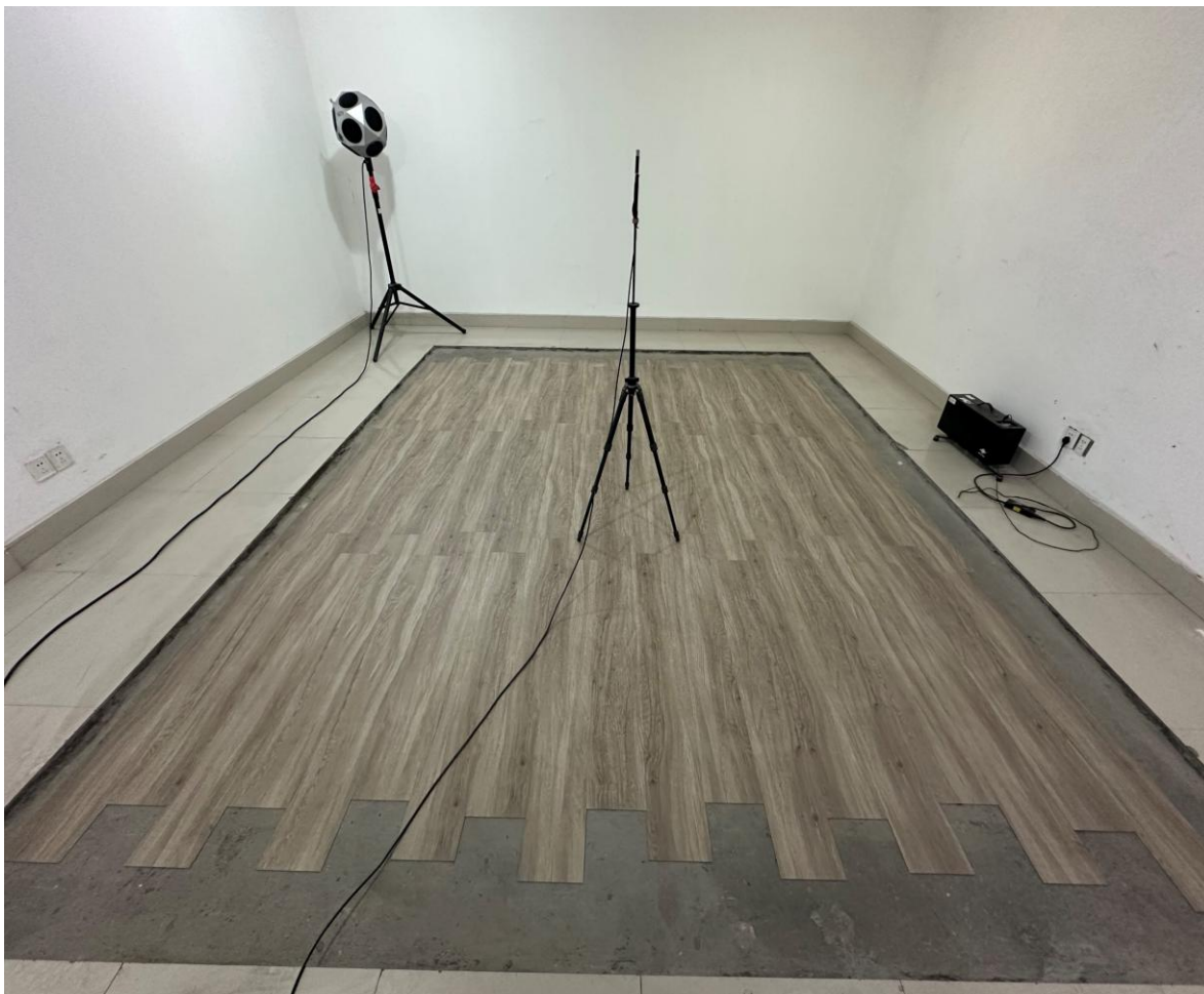
Test set up